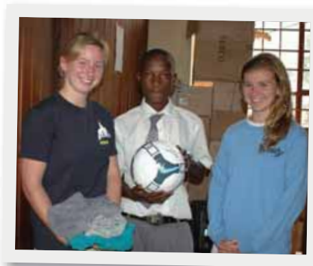
Our kids want to extend a special thank you for all the time and resources GPC has donated - especially soccer balls!