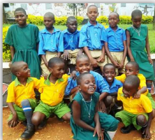
Welcome to the COU family class of 2013!

total students (122 male & 146 female) enrolled in either primary, secondary, vocational, or university education.