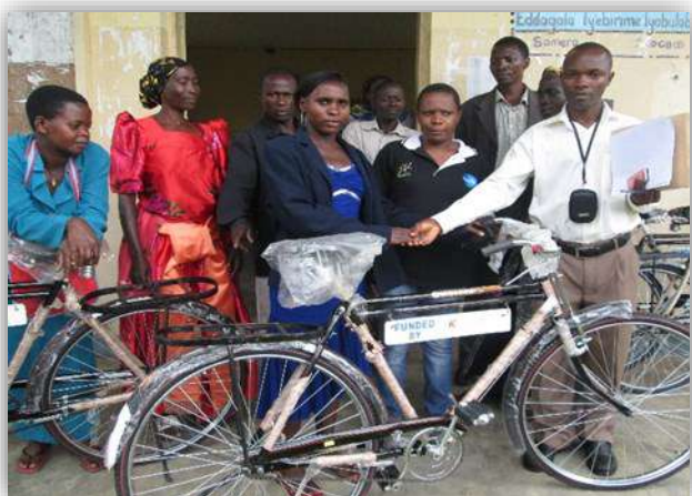
On Nov. 7th, 2013, COU—with support from the IDF grant—provided 20 child protection committees with one bicycle each to better enable follow up on reported abuse cases and protect children's rights.

$80,000 was awarded in grant funding via the Independent Development Fund (IDF) to implement the CR2CL project in Kasasa and Kakuuto sub counties of Rakai District—with a 2 year roll-out and initial funds received July, 2013, the following progress was made: