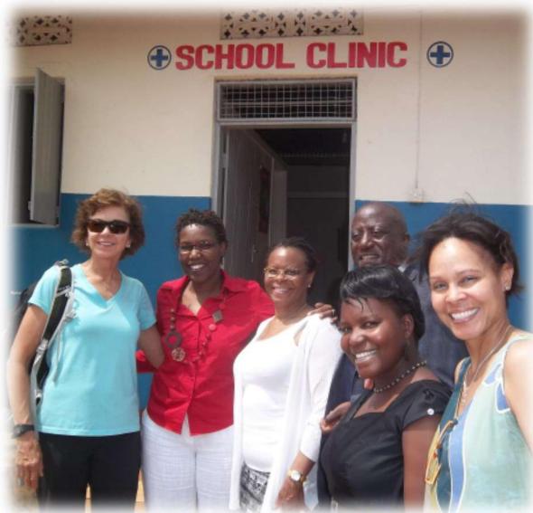
Board members and our team in Uganda join forces to improve the health of Kamuli's kids!