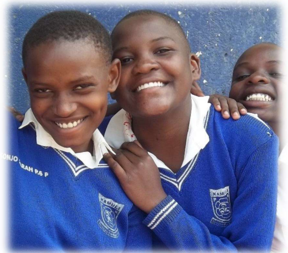
Students in school have so much to smile about.

students were enrolled at various partner schools and institutions in 2015: 124 in primary school, 56 in secondary school, 19 in vocational and 26 at the university or college level.