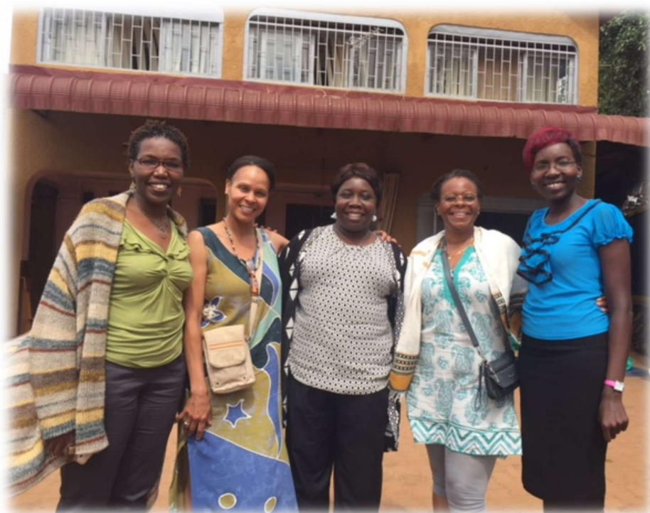
Partnering with local HIV clinic to help students receive proper medical diagnosis, care and treatment for HIV/AIDS.