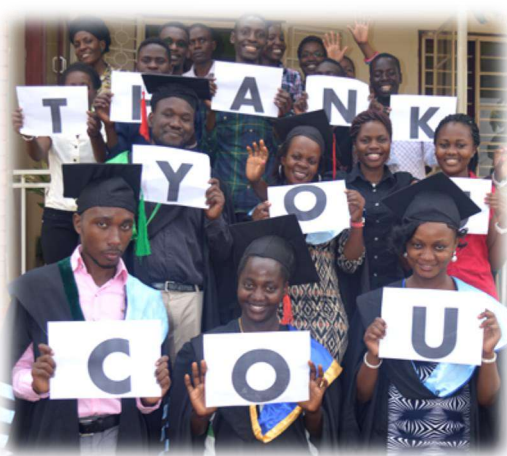
Our 2015 COU graduates are beyond thankful for your continuing support - which helps to make dreams come true!

university and teacher's training college students graduated from the program in 2015. They received degrees, diplomas and certificates in the following areas of study: Medicine, Arts with Education, Procurement and Logistics Management, Development Studies, Journalism, Grade III Teaching and Early Childhood Education.