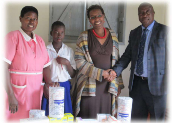
Children of Uganda delivers vital medical supplies to Kamuli School Headmaster and Nurse.

youth—both COU sponsored and community children—who attend Kamuli Primary School are now receiving improved healthcare thanks to our supporters who helped raise the funds needed to renovate and restock the school's health clinic.