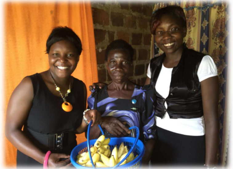
Our Family Empowerment Program is helping to feed families, build small businesses and send a message of hope.